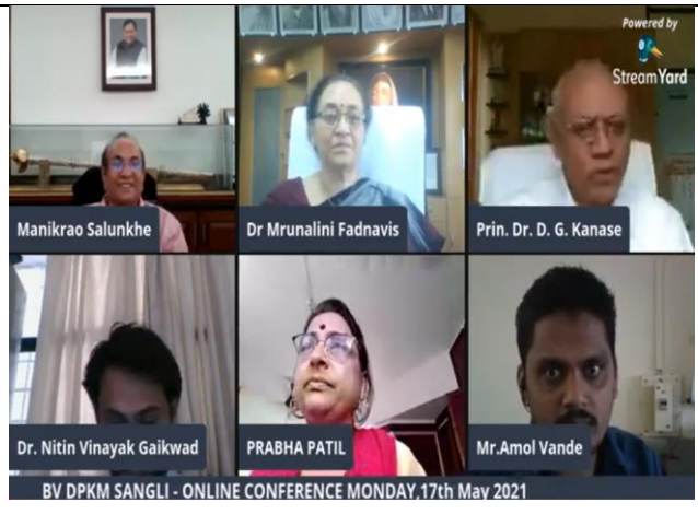
Multidisciplinary International e-Conference on “ Trends, Challenges and Issues in the Science, Social Science and Languages for Social Welfare”,