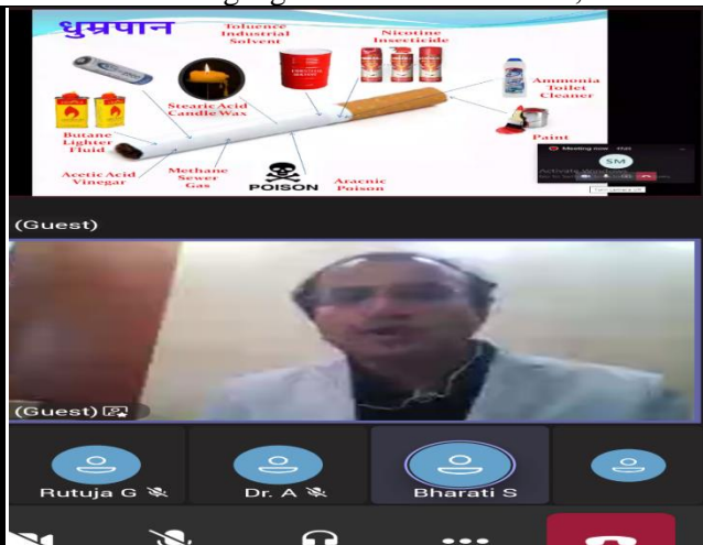
Online Webinar on “Observation of World No Tobacco Day”