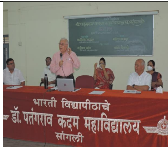
Reading awareness program on the occasion of Reading Inspiration day